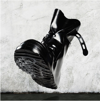
Seamless Bromobutyl Rubber

The Airboss Defense Group MALO overboot is constructed with bromobutyl rubber and provides chemical, biological, and battlefield contaminant protection. It is the premier overboot solution world-wide and is currently fielded with Canadian, UK, and US forces, and has been integrated globally with most chemical protective ensembles.