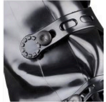
Ambidextrous Design for Easy Donning and Doffing