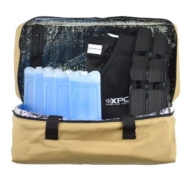
Includes: 4 PhaseCore XPC Cooling Vests, Extender Sets, 1 Transport Bag, and 5 Ice Packs

Heat activated PhaseCore XPC Cooling Vests absorb body heat and provide a long-lasting cooling effect that will not overcool the body. The gentle and systematic cooling effect will help to increase productivity while reducing heat-related illness, stress, and injuries. Designed to be comfortable and lightweight, PhaseCore Cooling Vests prepare you to handle any task.