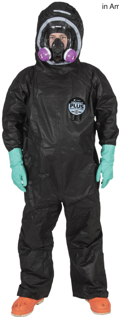
Front of KAP-PPH459-99

In addition to passing the ASTM F1671 blood and viral penetration tests, ProVent Plus is a microporous fabric that offers increased comfort due to its high moisture vapor transmission rate (MVTR). Available in black and in blue configurations. Heat sealed / taped seams. Made in America. Submit a quote request and receive special discount pricing.