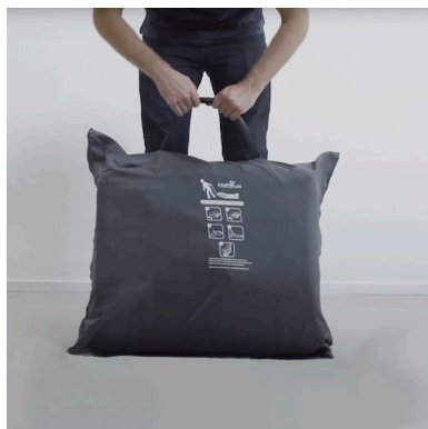
Hand Carry S-CAPEPLUS Storage Bag (Included)