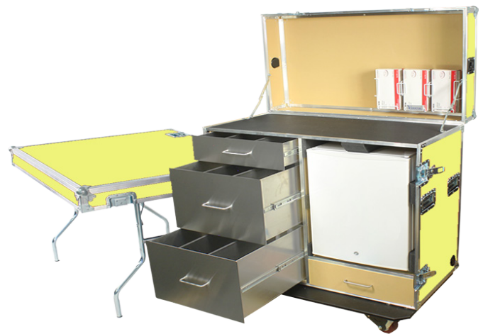
48" Workstation with Refrigerator