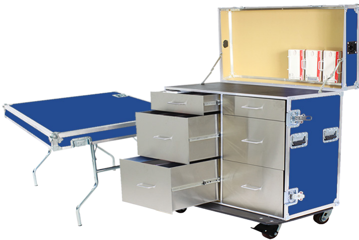
48" Workstation without Refrigerator

The Vericor 48" Workstation is an excellent solution for mobile point-of-care access of supplies. Choose from the 3 drawer or 6 drawer model. Both models have a detachable table for extra workspace. The refrigerator (adjustable and without freezer) model has three drawers for storage and a refrigerator for vaccine or other temperature sensitive product. The unit opens up easily by undoing a few latches and is immediately ready to work. This self-contained workstation is on wheels and is ideal for in-field clinics needing to store, organize, and transport medical supplies. It has transport handles so the unit can move when and where it is needed. It is lockable for secure storage and has glove holders in the lid for easy access. It also has easy lock wheels with a wide wheelbase so the unit can be maneuvered easily and safely.