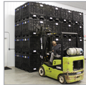
4-way Forklift Access