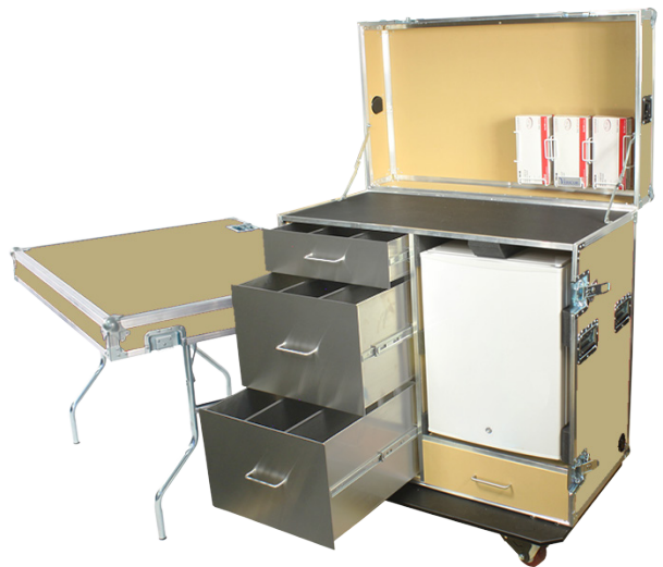
42" Workstation with Refrigerator