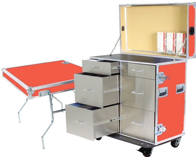
42" Workstation without Refrigerator

This mobile workstation is an excellent solution for Mobile Point-of-Care Access of supplies. It has either 3 or 6 drawers for storage (depending on model), and a detachable table for working on. The refrigerator (adjustable and without freezer) model has three drawers for storage and a refrigerator for vaccine or other temperature sensitive product. The unit opens up, and is ready for work, easily by undoing a few latches. This self-contained workstation is on wheels and is ideal for in-field clinics needing to store, organize, and transport medical supplies. It has transport handles so the unit can move when and where it is needed. It is lockable for secure storage and has glove holders in the lid for easy access. It also has easy lock wheels with a wide wheel base so the unit can be maneuvered easily and safely.