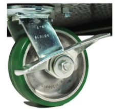
Four locking swivel 6" casters