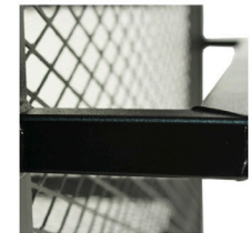
Two Steering Handles